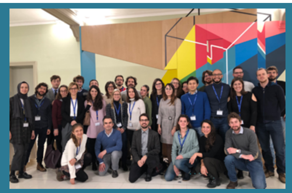
Expressions of interest for the next round of admissions (cycle 36) are now open. The official call will be released in March 2020 and will close in April 2020. Courses will start in September 2020.